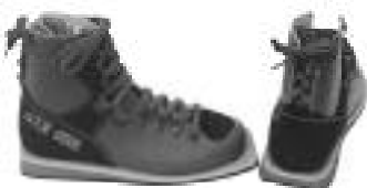
Anschütz M133 Shooting Boots