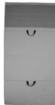
Winstead Shooting Mat