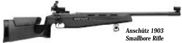
Anschütz 1903 Smallbore Rifle