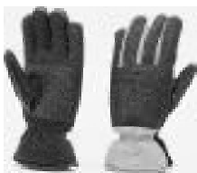
Anschütz Standard I and Standard II Shooting Gloves