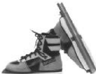
Thune Evolution Shooting Boots