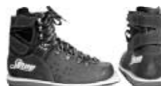
Anschütz M130 Stenvaag Shooting Boots

•Shooting pants are also available used or new in off-the-rack sizes. •The AHG Anschütz M144 double canvas is an excellent buy. •The comments above about coats apply here as well.