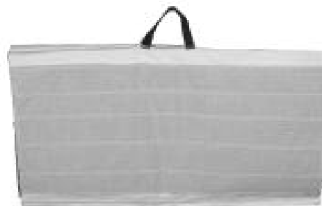
Winstead Mat, Folded

The unusual feature of this mat is the construction. Because it is not sewn down the sides, you can remove the padding and throw the mat into the washing machine. Just like magic, a clean mat. You can also add or remove padding as you desire for your comfort. The padding is common carpet padding, and the rules are quite liberal as to thickness.