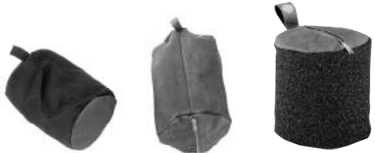
Gunsmithing Cordura Kneeling Roll (left), Gehmann Leather Kneeling Roll (center), & Anschütz Top Grip™ Kneeling Roll (right)

A good kneeling roll will give the shooter proper support and allow for a comfortable, steady position. The kneeling roll must conform to the shooter's instep. A kneeling roll can be stuffed with several different materials. The material you choose must allow the roll to be flexible enough to fit your instep but not too flexible as to compromise support. Cedar chips make an excellent stuffing. These chips can be found at any pet store (gerbil litter). Three kneeling rolls are stocked: the Gehmann leather, the Gunsmithing, Inc. cordura and the Anschütz Top Grip™. Each does a good job. All are shipped empty and conform to the current ISSF rules.