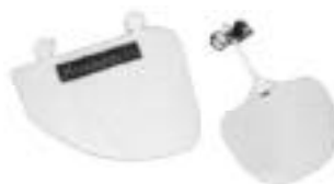
Side Blinder, (left) and Cover Disc (right)

A fully adjustable lens is only part of the story. In addition, there are cover discs for the non-aiming eye. For shooters, it is important to keep both eyes open. The closing of the non-aiming eye affects the aiming eye and leads to fatigue in the eyes. Another accessory for shooting glasses is blinders. They protect against light and glare. Many shooters feel they help avoid distractions and aid in concentration.