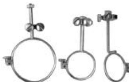
Knobloch Optik 37mm lens holder (left), 23mm lens holder (center), and 23mm lens holder offset (right).

The special construction of Knobloch's Universal Shooting Glasses permits shooters to adjust the lens to any position suitable to the correct angle of sight. You can adjust the lens so that no matter what angle you view the target, you automatically look through the very center of the lens. As the name Universal implies, the shooting glasses serve a universal purpose for rifle and pistol shooting, for right- or left-handed shooters, as well as for all types of aiming.