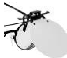
Gunsmithing, Inc. Blinder

The headbands have elastic exterior, absorbent interior and are very colorful.