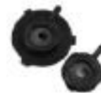
Adjustable Iris for Pistol, Large and Small

For pistol shooters, an adjustable iris and color filters are available to control light and help focus on the front sight.