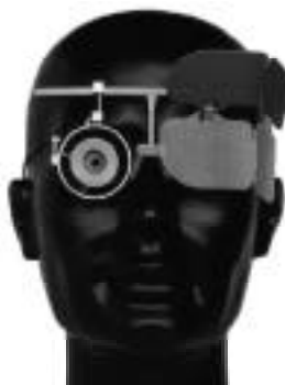
Champion Shooting Glasses Model World 1, shown with optional 42mm Iris and 42mm Lens Holder

We have the World 1 frame set which has a fixed height nose piece. It comes with a case, double blinder and one lens holder.