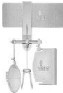
Winner Headband Shooting Glasses