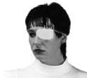
Anschütz Headband w/ Blinder

AHG Anschütz has come out with two blinders that are attached to headbands. One is a jointed blinder that can be tilted to all sides by a joint. These are infinitely adjustable to the shooter. The other is a non-reflective and scratch-resistant blinder.