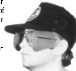
Gunsmithing, Inc. Side Blinders

Reduce peripheral vision distractions with the side blinder set that slides onto the glasses temples. These blinders are made of opaque, durable, long lasting, green plastic.