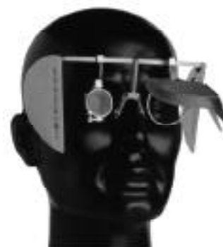
Champion Shooting Glasses Model World 2, shown with optional Filter and Side Blinder

The World 2 frame set is the same as the World 1 except that it has an adjustable height nose piece. It also comes with a case, double blinder and one lens holder.