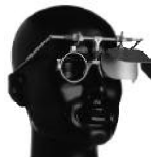
Champion Shooting Glasses Model Olympic

The Olympic model is just about the ultimate in adjustability. Everything on the frame is adjustable from the brow bar to the ear pieces to the nosepiece to the lens holders. The Olympic comes with a case, double blinder and one lens holder.