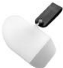
Anschütz Clip-on Blinder

The headbands have elastic exterior, absorbent interior and are very colorful.