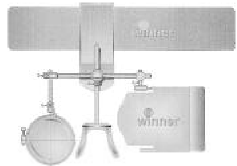
Winner Headband Shooting Glasses

Winner has come out with a new concept in shooting glasses. There has always been a problem with keeping glasses positioned just right, and most shooters wear some sort of a headband. So ... we now have the Winner Headband Shooting Glasses. The headband fastens in the back with velcro so it is tight and comfortable. You can place it exactly where you need it, and it will stay there. The lens holder, blinders, nose piece and any other accessories clip directly to the headband and are fully adjustable with quicklocks at all moving points. There are no earpieces to annoy or slip and change the position of the lens. The basic set includes the headband, one lens holder, one blinder, frame, nosepiece and case.