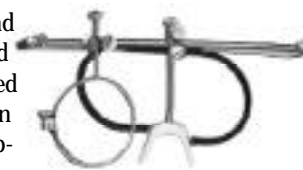
Knobloch Optik Universal Frames