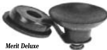
Merit Deluxe Optical Attachment

Also for the pistol shooters, Merit has the Deluxe Optical Attachment that attaches to your glasses with a suction cup and really clears up those fuzzy sights. The aperture adjusts from .020" to .155".