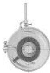
Winner Headband Shooting Glasses Iris